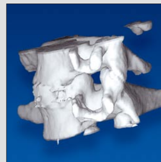
The three dimensional depiction shows the excellent biomechanical integration of the implant