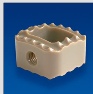
NUBIC®: Vertebral body fusion - simple and efficient

Implants available single packed and sterile, ready to use.